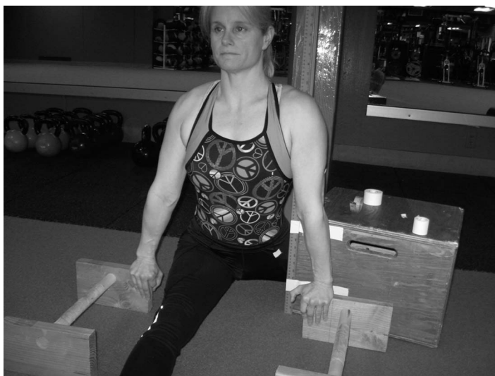
Figure 2. Staged test protocol position. Note the flexed rear leg holding the shank vertical to control pelvic alignment. A ruler is shown near the anterior superior iliac spine, which is identified by a white piece of tape.

Following each trial, the subject was asked to rate the pain she felt while in the lowest split position from 0 to 10. The pain scale was described as 0 indicating no pain and 10 as the worst pain she had ever felt. Both trial pain scores were recorded to obtain evidence regarding whether the subject varied her motivation across